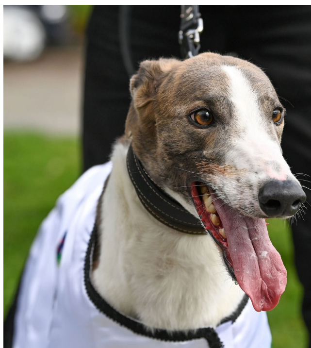
Ferdinand Boy makes it a triple at Healesville

How the race was won: Unbeaten in six appearances at Healesville, including the fastest heat performance, Hill Top Jonah started $2.60 favourite from Box 1, ahead of Ferdinand Boy at $3.10 from Box 5. He sprinted to the front with a 6.42sec first split and dominating proceedings as he defeated the strong-finishing Tiggerlong Tonk by 2.67 lengths in a flying 18.88sec. In addition to the $50,000 Cup winner's purse, Ferdinand Boy was also the recipient of a $50,000 bonus for winning three Victorian country cups in a calendar year, having reigned supreme at Ballarat and Shepparton earlier in the year. Ferdinand Boy took his record to a remarkable 28 wins from 50 starts, with his commanding Healesville victory and the monster bonus taking his career earnings to $398,134.