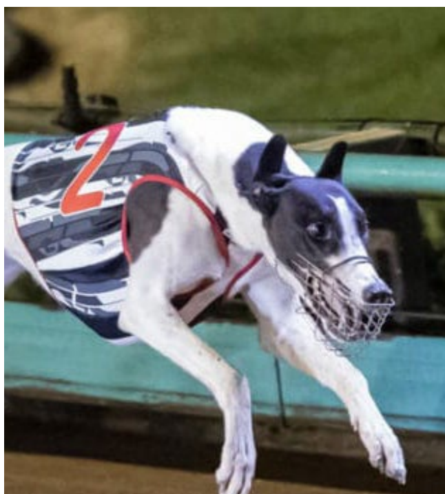
Gypsy Wyong in flight for the Top Cat Cup