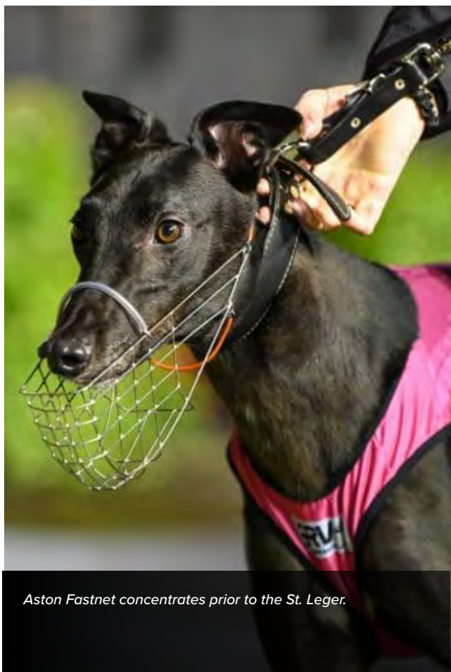
Aston Fastnet concentrates prior to the St. Leger.