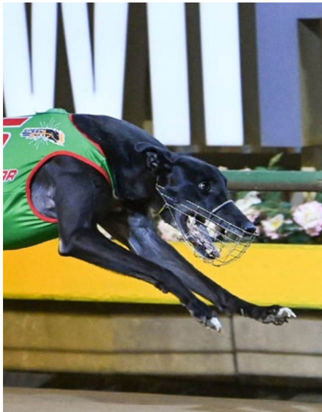
Five Star clocks 49.50 against Hank the Hustler.

How the race was won: New staying sensation Five Star won his match-race over Hank The Hustler by 4.5L and clocked the fastest individual time of 41.50sec. It was 1.84L quicker than SA star Sir Truculent who posted the second fastest overall time of 41.63sec, followed by Here's Tear's – who finished second in last year's Speed Star (725m) at The Meadows – in 41.68sec. Runner-up in the Listed Cup Night Stayers, Five Star notched his seventh win from 24 starts.