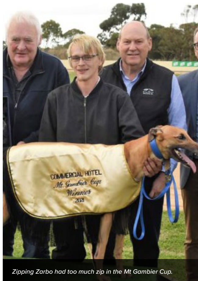
Zipping Zarbo had too much zip in the Mt Gambier Cup.