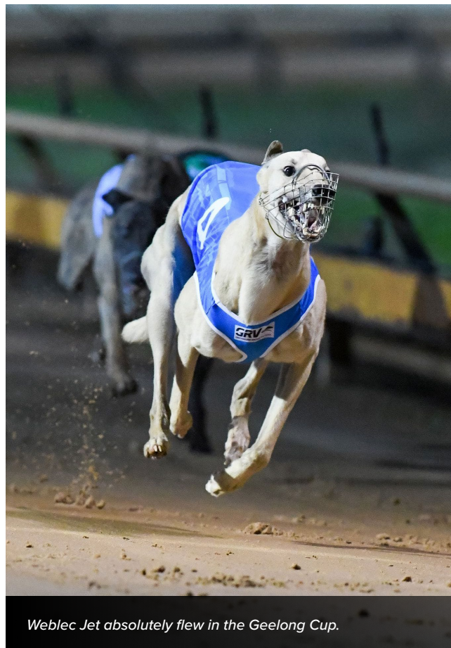
Weblec Jet absolutely flew in the Geelong Cup.