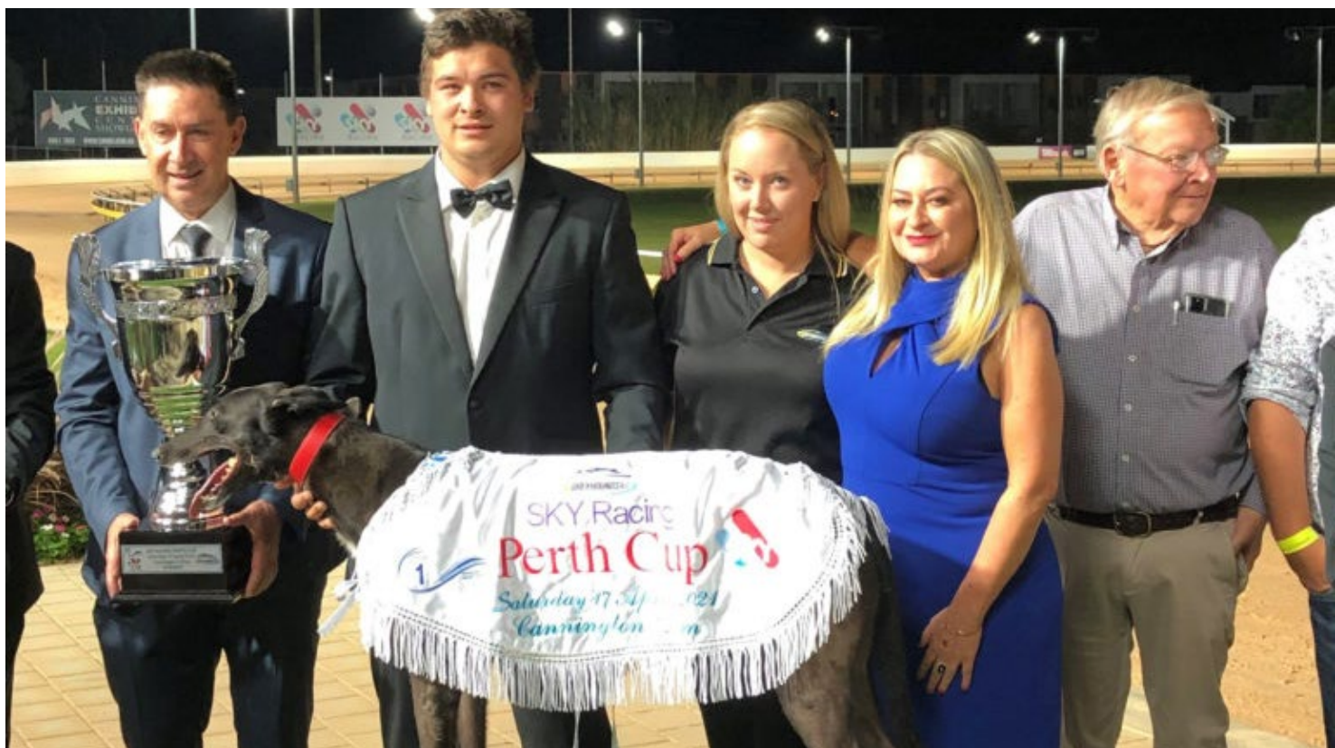
It took ten attempts, but Tiggerlong Tonk landed his first G1 at Perth.