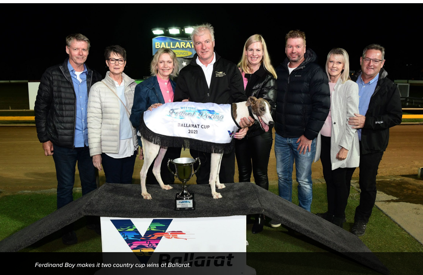
Ferdinand Boy makes it two country cup wins at Ballarat.