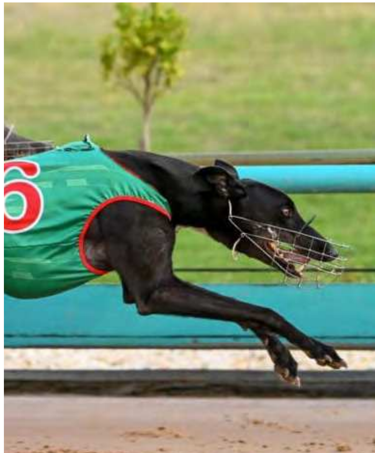
Jazz Opera conducts the field in the Vic Bred Final.

How the race was won: Fine-tuned sprinter Jazz Opera ($6.30) exited smartly from Box 6 and was quickly in the 'dress circle' defeating the fast-finishing Plan Ahead ($10.00) by 0.84L, with outsider Ridge ($32.40) a further 2.47L away third in a tidy 30.02sec. It was Jazz Opera's second victory from only five starts and her second win from three starts at The Meadows.