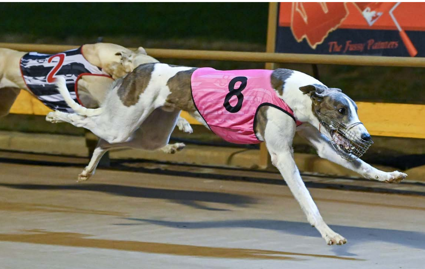
Ferdinand Boy streak ahead of Catch The Thief.