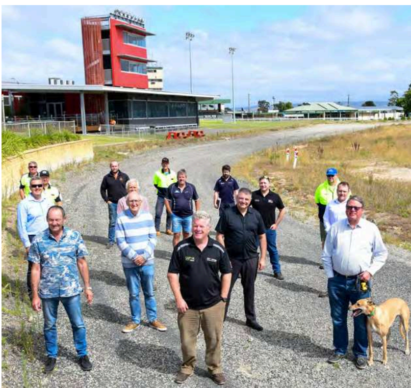
Work is underway for the new Traralgon track