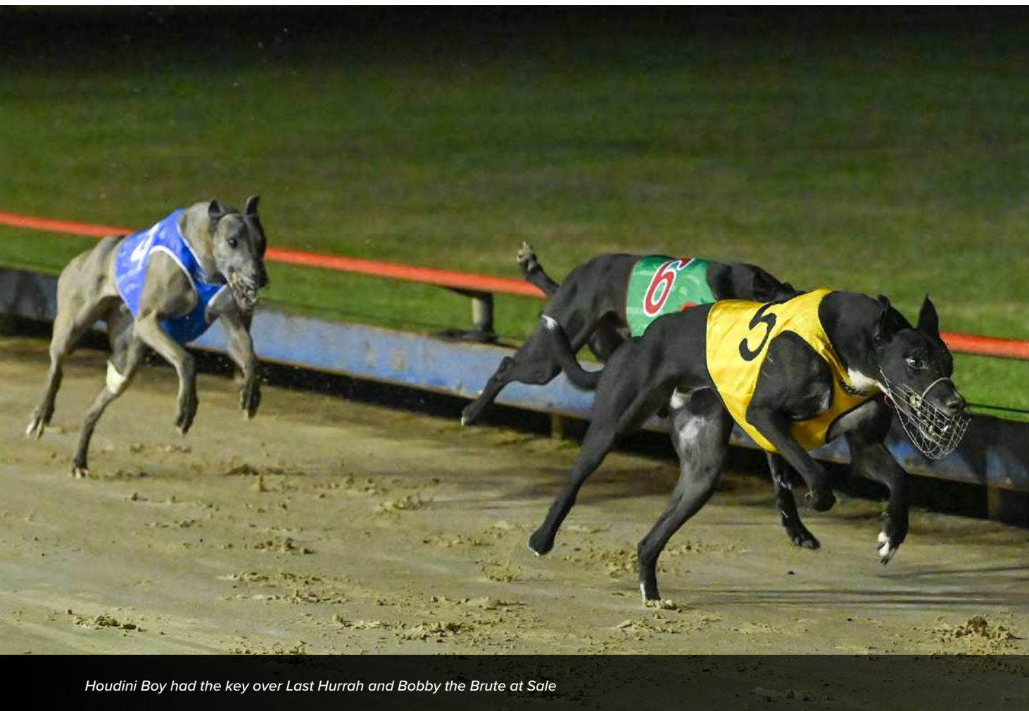
Houdini Boy had the key over Last Hurrah and Bobby the Brute at Sale