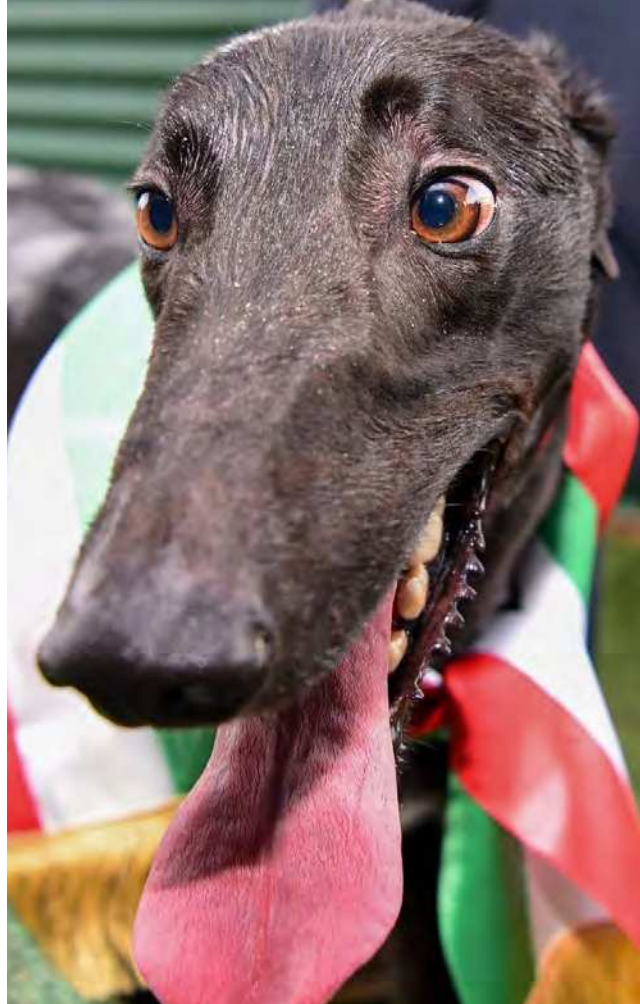
Making Gravy, coursing greyhound of the year.

Gotham Princess (Walk Hard x Gotham Queen) began the year by winning the Larmax Trading Puppy Event at Lang Lang before continuing her love affair with Lang Lang by taking out the Sylvester Doyle Puppy Classic.