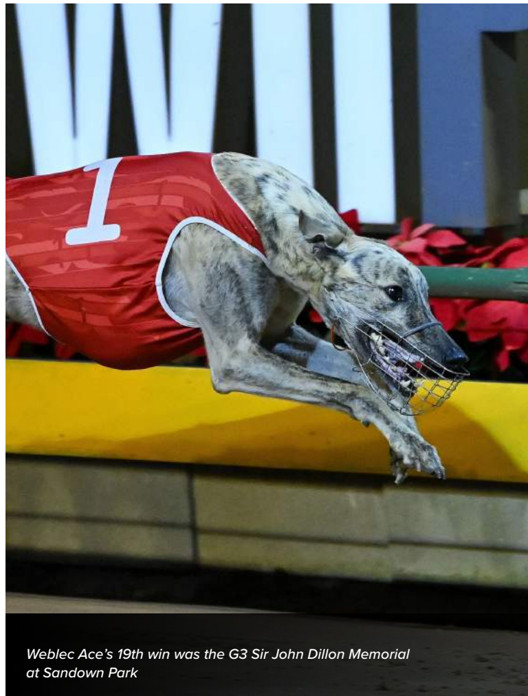
Weblec Ace's 19th win was the G3 Sir John Dillon Memorial at Sandown Park

How the race was won: Weblec Ace ($2.60F) jumped well from Box 1 and camped behind kennelmate Mepunga Maggie before taking over approaching the home turn. He then held off the barnstorming Christo Bale ($2.90) in the home straight to score by 0.54L, with Mepunga Maggie ($53.00) a further 1.67L away third in a smart 33.89sec. It was Weblec Ace's 19th win from 48 starts. He also won last year's G3 Cranbourne Classic (520m).