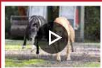
First-season coursers and same-sex races