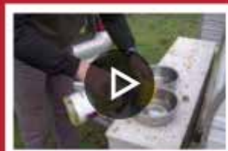
Welfare issues and how to avoid them