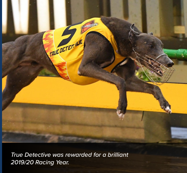
True Detective was rewarded for a brilliant 2019/20 Racing Year.