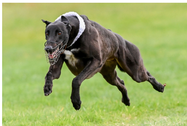
Making Gravy takes out the Waterloo Cup final.