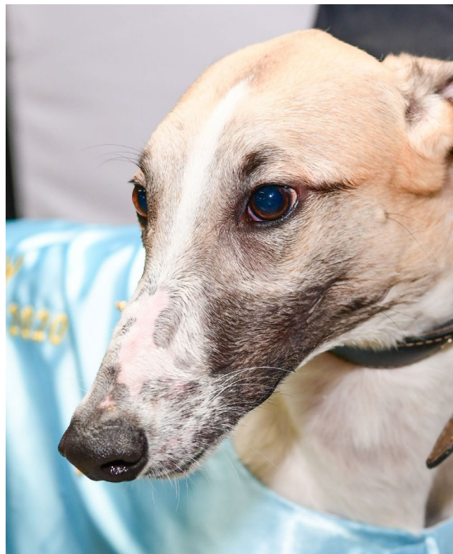
Taken opened his group racing account in the Cranbourne Classic.

How the race was won: Taken (Box 8) tracked wide and was third behind kennelmate Fire Legend and Catch The Thief down the back straight. But the race changed complexion when Fire Legend and Catch The Thief 'brushed' approaching the circle. Subsequently, Taken swept to the lead and held off Arizona Eyes ($26.70) by 2.36L, with Manila Knight ($10.70) a further 1.2L away third in 30.11sec (Best). Catch The Thief ($2.00F) finished an unlucky seventh, only 5.8L from the winner. Taken, who finished fourth to Catch The Thief in the G3 Warragul St Leger, notched his 14th from 39 starts.