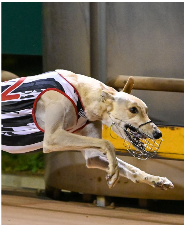
Catch The Thief made it nine wins from his past 12 starts when taking out the St Leger.

How the race was won: Weblec Ace (Box 3) staged a herculean performance to mow down Australia's No. 1 sprinter Simon Told Helen ($2.60F). He spotted the four-time Group 1 winner around 50m from home in 29.61sec. Yindi Girl Turbo ($27.70) finished third, 2.39L from the winner. Weblec Ace notched his 15th win from 36 starts. It was also the G2 McKenna Memorial finalist's fifth win from 13 starts over 515m at Sandown.