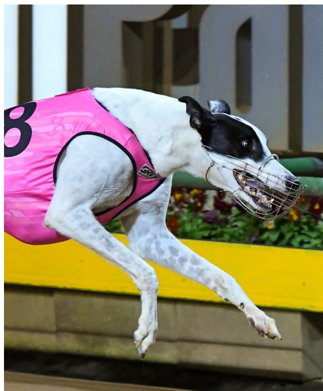
Here's Tears continued his wonderful affinity with Sandown Park.

How the race was won: Here's Tears (Box 6) adopted an uncustomary racing pattern by assuming the role of 'pilot' and leading his rivals a merry dance. He strolled to an effortless 3.99L win over Sunset Bourbski ($3.80), with Tornado Tears ($7.60) a further 0.72L away third in 42.45sec. Sandown's 715m track record holder registered his 15th win from 42 starts. It was also his fourth win from nine outings over Sandown's staying journey.