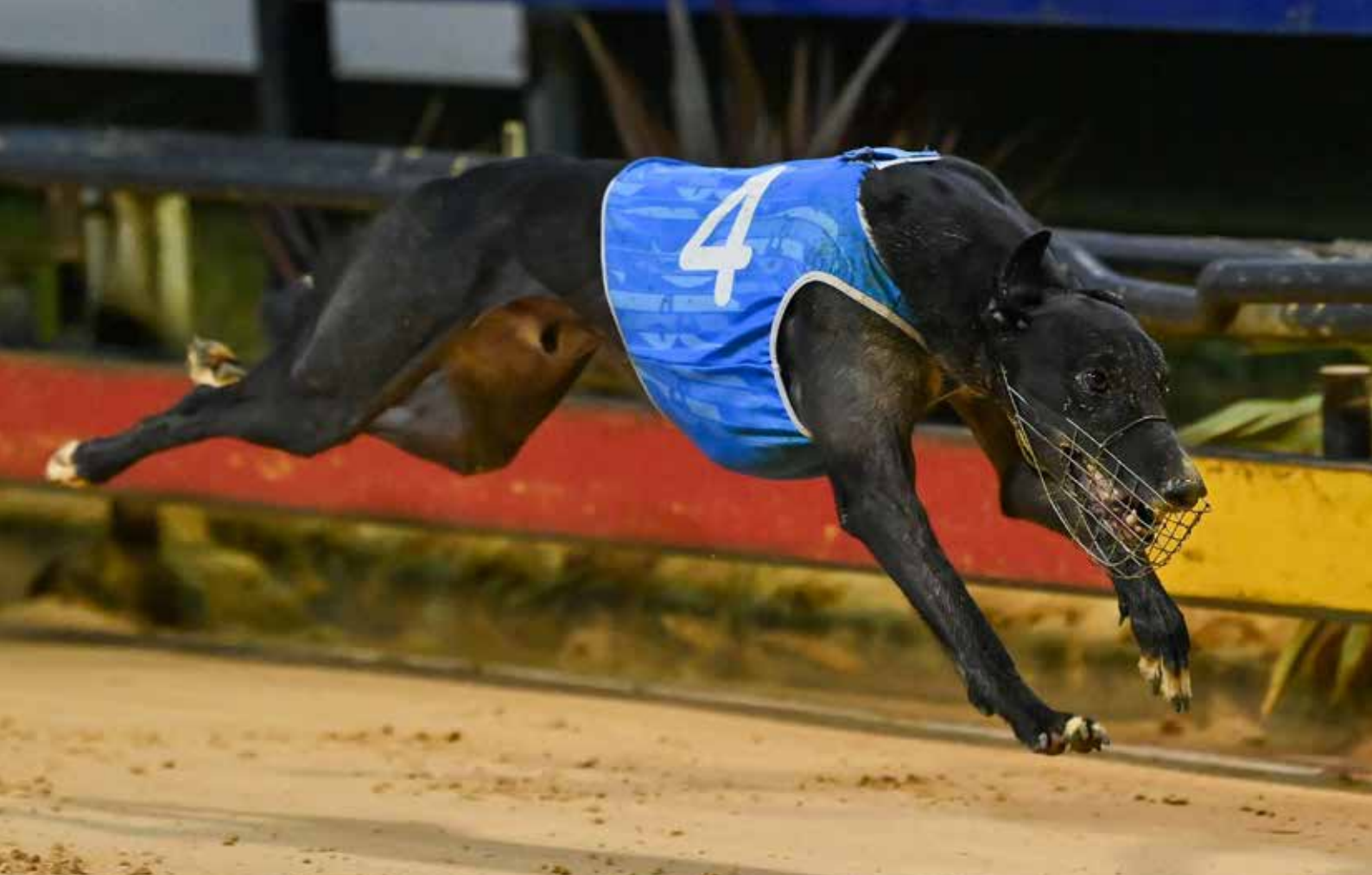
Houdini Boy came from last snare the $20K to-the-winner Trio's Winter Cup in just his seventh career start.