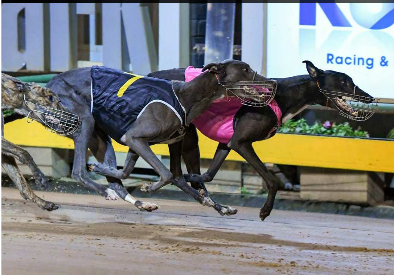
Bronski Beat holds off True Detective at Sandown.

How the race was won: He flew out from Box 2 but had Simon Told Helen on his hammer for the entire trip. On the line, he had one length to spare over Simon Told Helen ($2.50), with rank outsider Leon Bale ($45.00) a further two and a quarter lengths away third in 24.80sec (Best) – just over one length off the 24.72sec track record set by Unlawful Entry in April 2016. It was his 12th win from 16 starts. Zambora Smokey also remained unbeaten in four starts over 450m at Warrnambool.