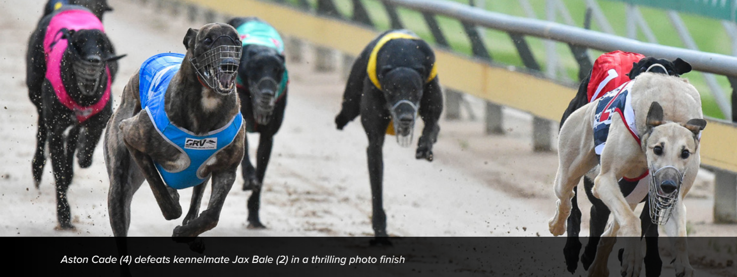
Aston Cade (4) defeats kennelmate Jax Bale (2) in a thrilling photo finish