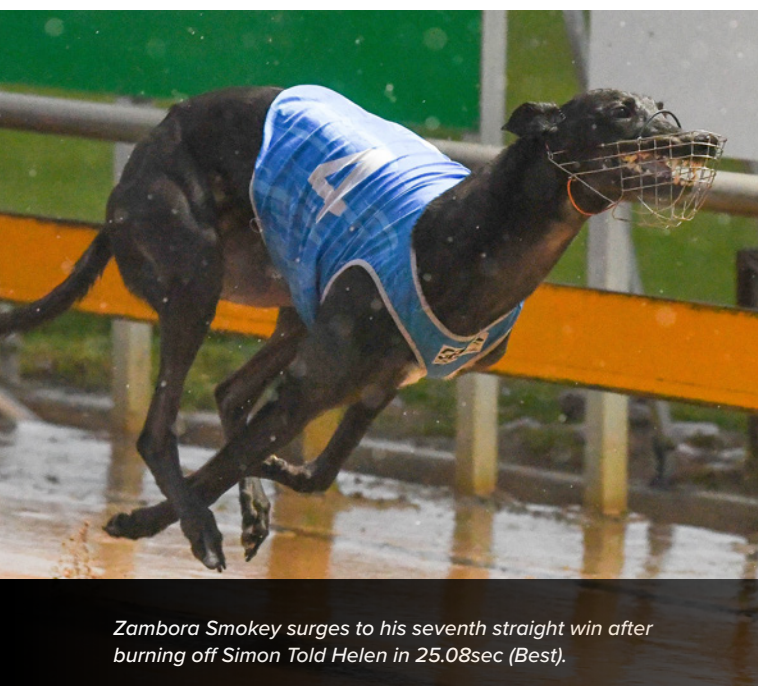
Zambora Smokey surges to his seventh straight win after burning off Simon Told Helen in 25.08sec (Best).