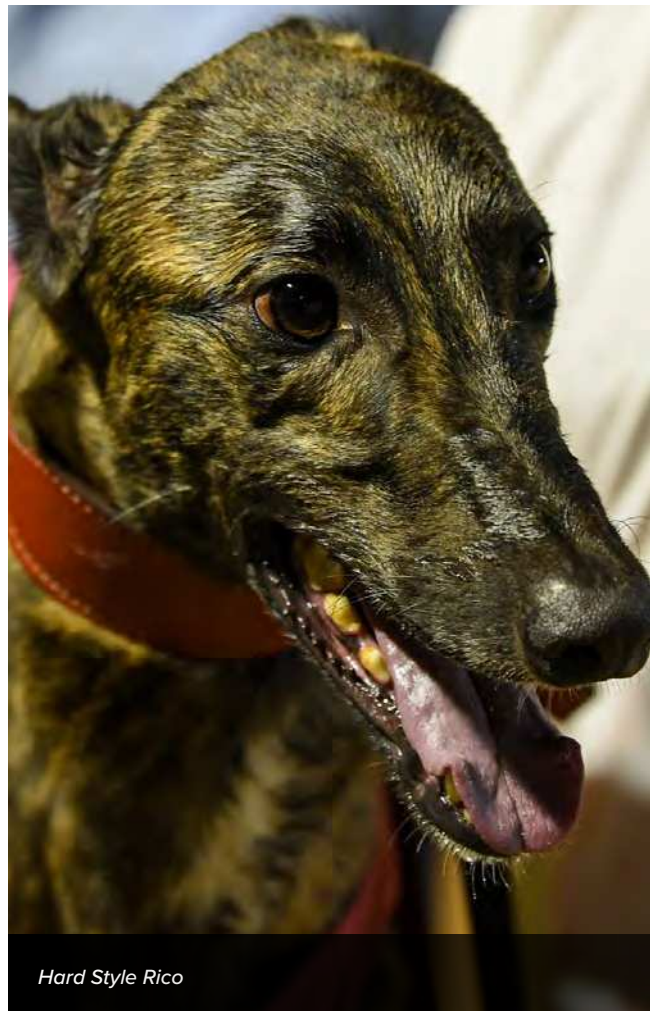
Hard Style Rico

How the race was won: Jumped cleanly from Box 8 and displayed amazing mid-race acceleration to put the race away within a twinkling of an eye. He accounted for G1 Gold Bullion finalist Snags McKenzie ($30.60) by just over two and a quarter lengths, with G1 Melbourne Cup and G1 Temlee winner Whiskey Riot ($2.50F) just over one length away third in 24.80sec (Best). (He established a 24.77sec track record in a heat). He was a finalist in this year's G1 Silver Chief (6th), G1 National Derby (4th) and G1 Australian Cup (7th).