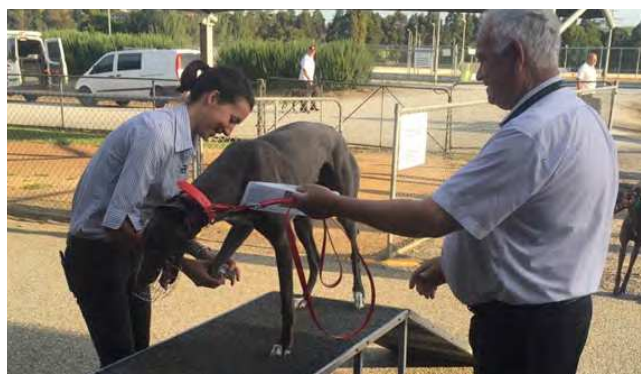
Vet checks for pre-kennelling and pre-race are being conducted in the open air, where possible.