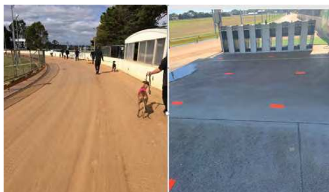
Greyhounds and handlers are spaced apart when heading to the starting boxes, while place markers are used to keep participants separated behind the boxes.